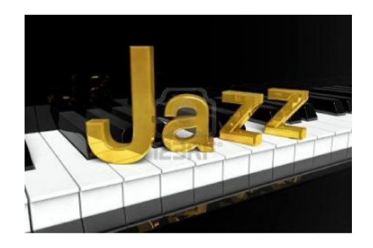
Please Join Us for a Free Evening of JAZZ 7 – 9 p.m. - Saturday, Dec. 7 in the Sanctuary Featuring: